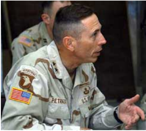
General David Petraeus

To wear our country's flag properly, the field of stars is worn closest to your heart. Further, when worn on the sleeve of a military uniform, the flag should appear to be advancing and not retreating. Thus, if your patch is to be worn on your LEFT sleeve, use a left flag (normal). For patches worn on your RIGHT sleeve, use a "right" or "reversed field" flag.