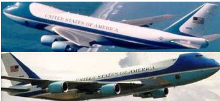
Air Force 1 showing the regular flag on the left side and the reverse flag on the right side.

The flag decals show the union (the blue area) on the side closer to the front of the plane. On the plane's left, the decal shows the flag with the union at the left, as usual. On the plane's right side, is a "right flag" or "reversed field flag" or "reverse flag," with the union on the right. This is done so that the flag looks as if it is blowing in the wind created by the